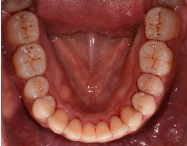
Occlusal view lower arch after treatment