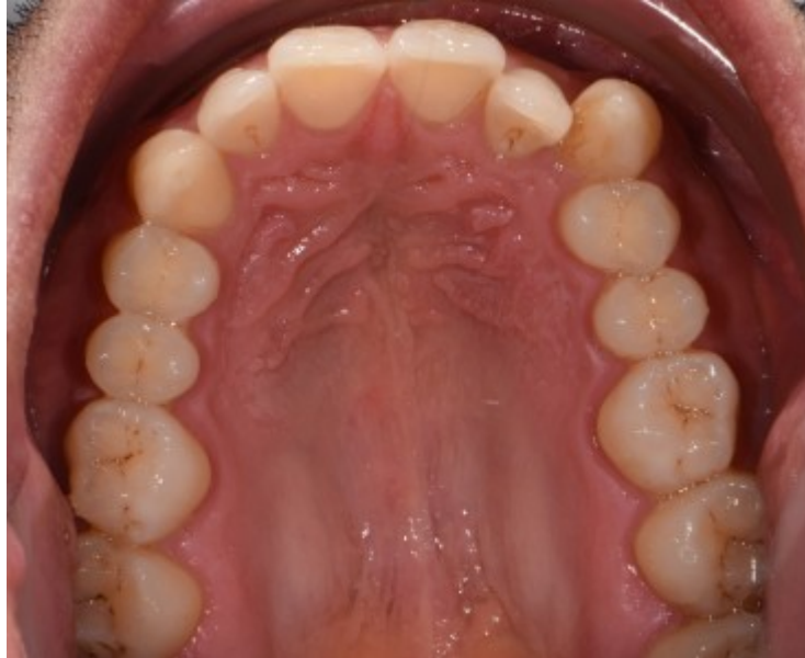
Occlusal view upper arch (t0)