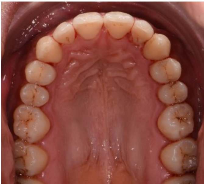
Occlusal view upper arch after treatment