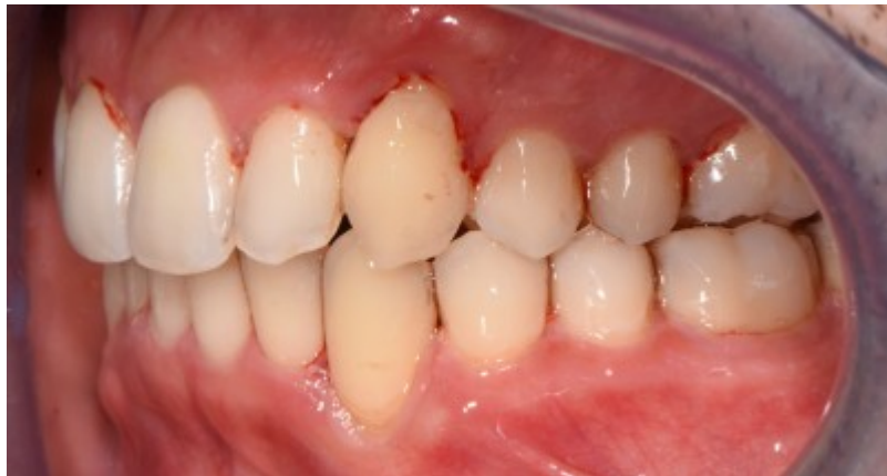
Lateral view left side after treatment