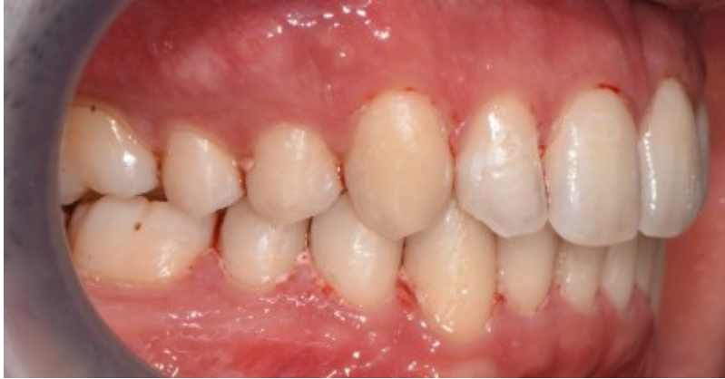
Lateral view right side after treatment