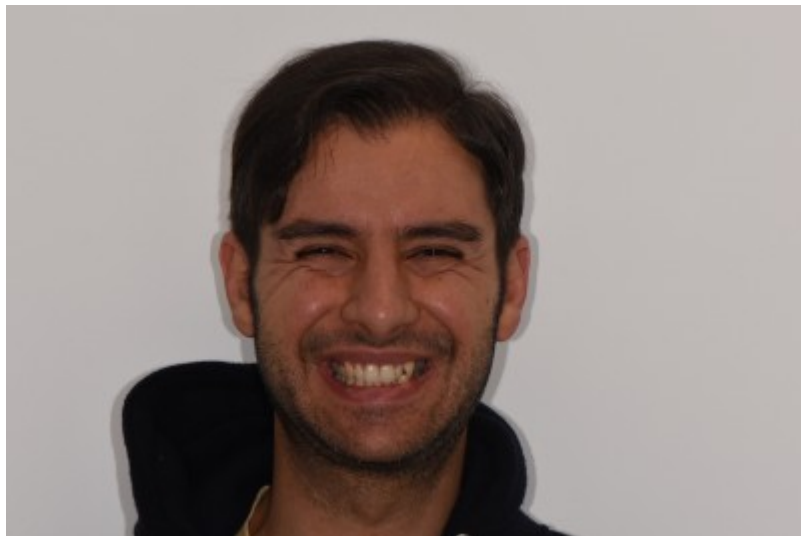
Frontal view (t0)