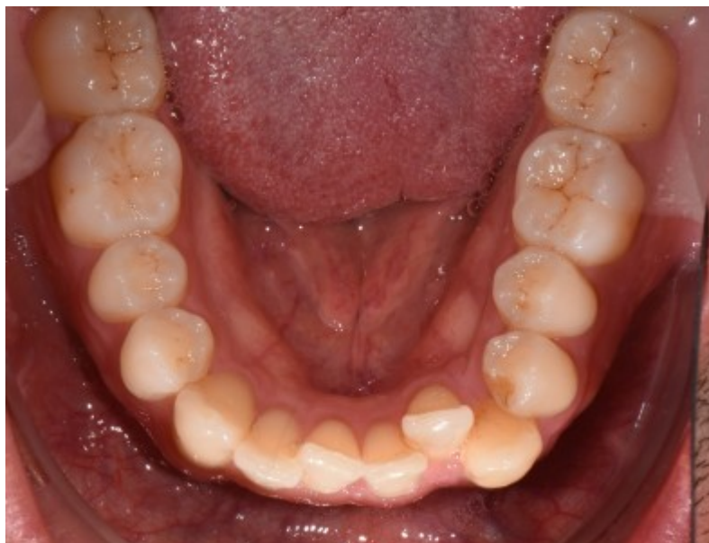
Occlusal view lower arch (t0)