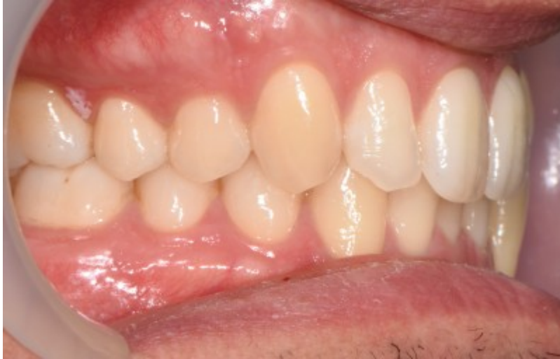
Lateral view right side