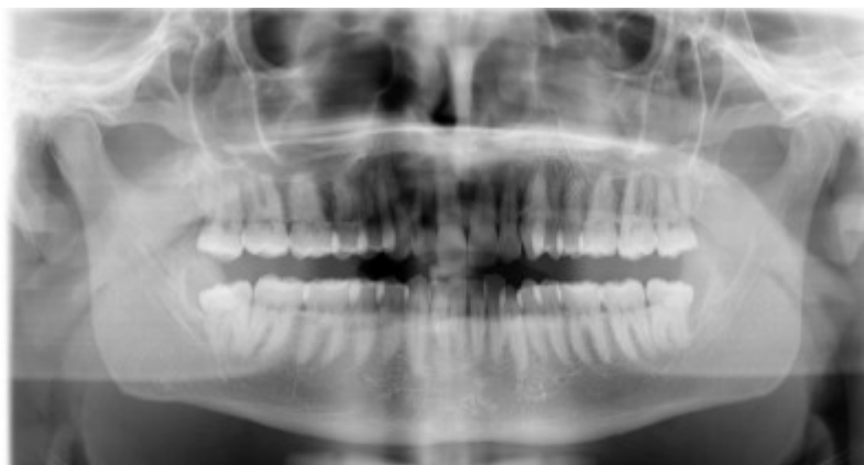
OPT after treatment