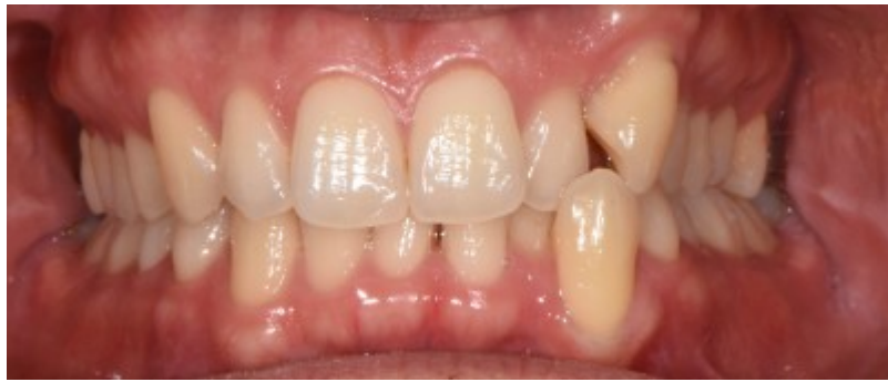
Smile before treatment