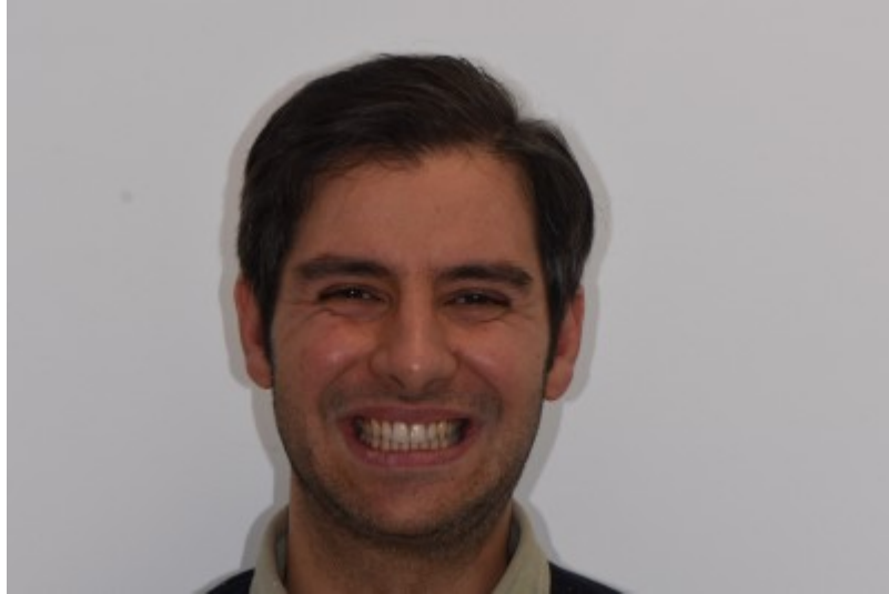
Extra-oral photo after treatment