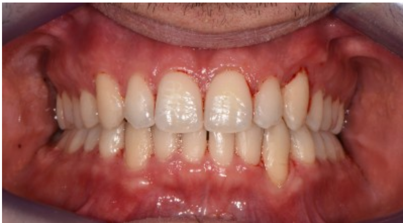
Smile after treatment