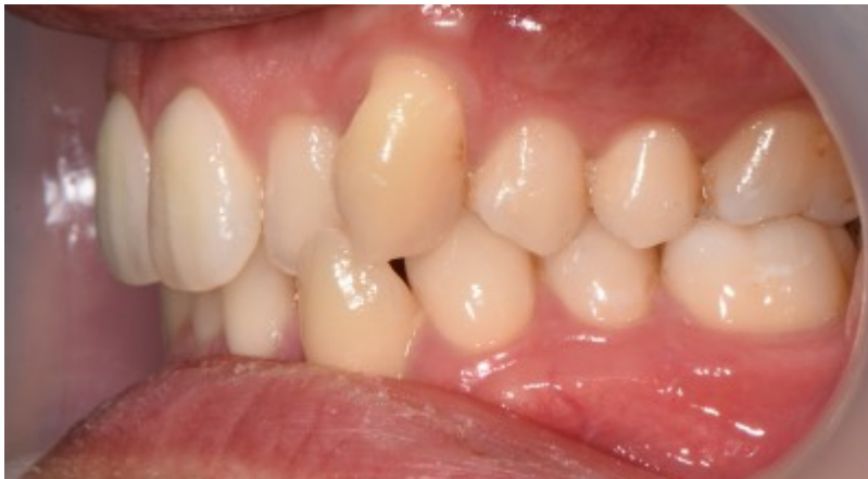
Lateral view left side